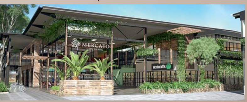
Mercato on Byron aims to be one of the country's first regional shopping complexes to achieve a five-star green star rating.

Built over two levels of shopping and entertainment, it will include a two-level basement carpark.