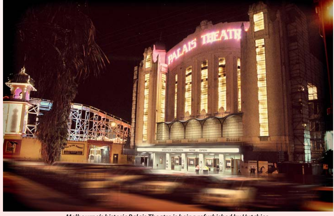
Melbourne's historic Palais Theatre is being refurbished by Hutchies.

The refurbishment will include new box office and cloak room, patch replacement of existing marble tiles, new candy bar, merchandise stand and café, new matching heritage carpet throughout, modifications to existing back of house dressing