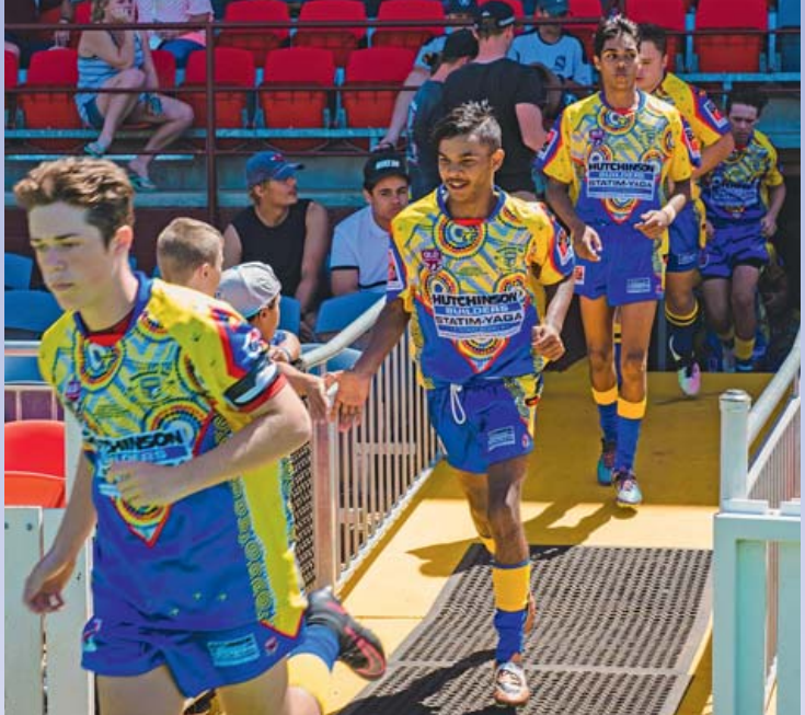
Indigenous footballers wearing Hutchies' Statim-Yaga colours running onto the field for the start of their game.