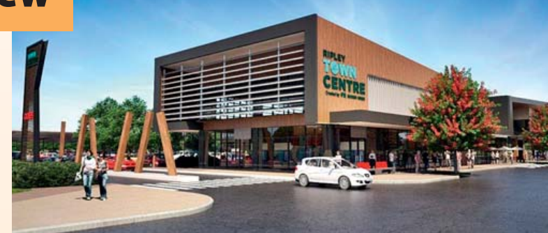
Artist's impression of Ripley town centre to service the Ripley Valley region in the western corridor of Ipswich.

The development will create a new regional hub to service up to 120,000 people expected to call Ripley Valley home over the next 20 years.